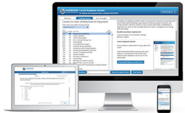
Online Interactive Career Portal